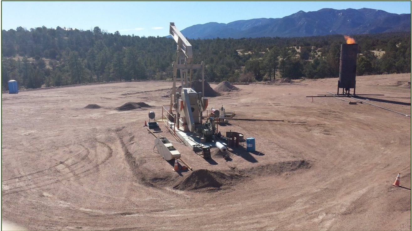
Pathfinder C11 -12 #1 HZ Well – Fremont County, Colorado

For the period ended 31 December 2017 With additional information on subsequently completed activities