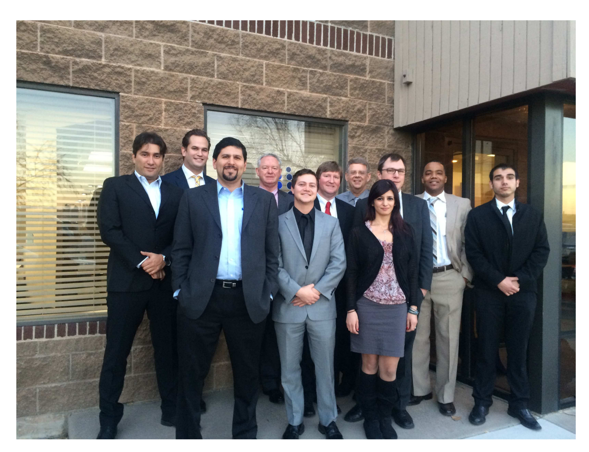
<u>Austin's Management – Operations & Engineering Team at quarterly SIX SIGMA training program in Denver, Colorado.</u>

with additional information on subsequently completed activities