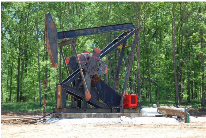
ARMSTRONG- ELLISLIE NO#1 PUMP JACK