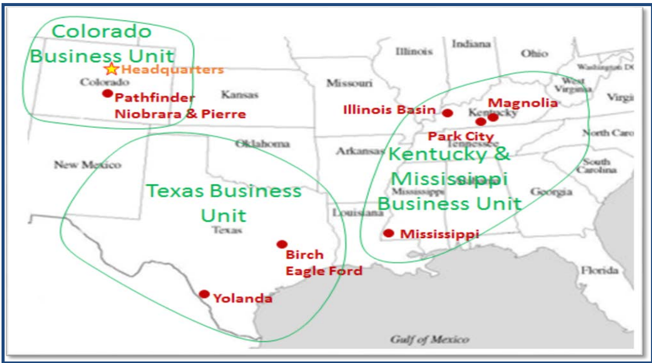
Map Showing Austin's North American Oil and Gas assets