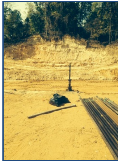
BOARD OF EDUCATION #2 WELL HEAD