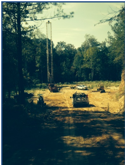
WORK-OVER RIG INSTALLING THE INJECTION SYSTEM IN THE BOARD OF EDUCATION SALT WATER DISPOSAL WELL