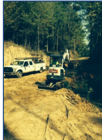
SITE CONSTRUCTION OPERATIONS PREPARE THE LOCATION FOR OIL COLLECTION & HAULAGE