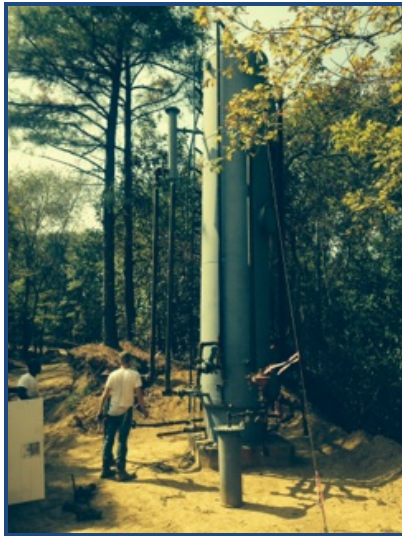
OIL AND GAS HEATER TREATER BEING TESTED