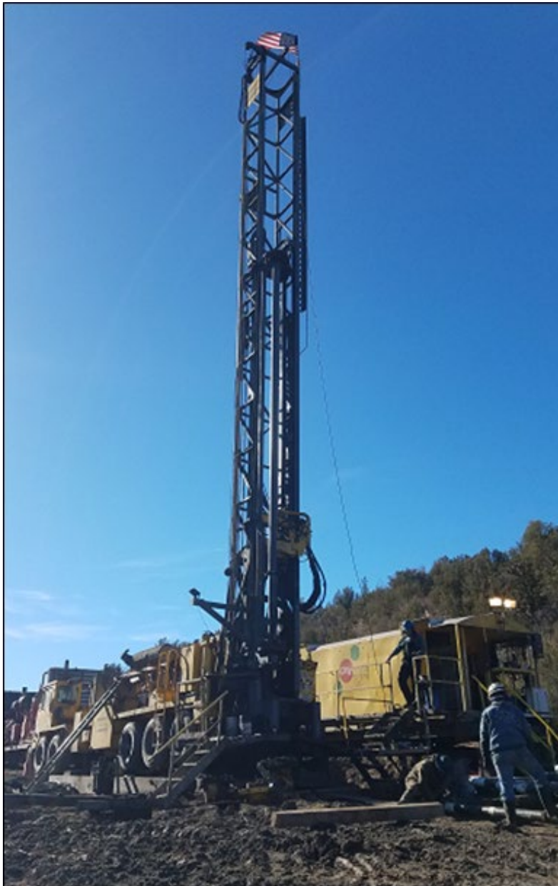
Drilling Operations on the Powell #23-25 Well