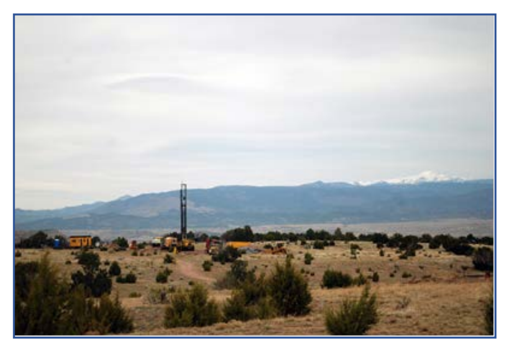
Operations underway at Austin's 15,282 acre flagship Pathfinder project in Fremont County, Colorado

Listed on the Australian Securities Exchange ("AKK") and the OTC in the USA (AUN-XY) {\bf ACN~114~198~471}