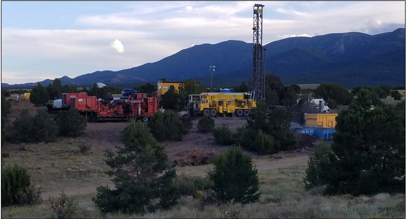
Bird #13-18 Well – Fremont County, Colorado

For the period ended 30 September 2017 With additional information on subsequently completed activities