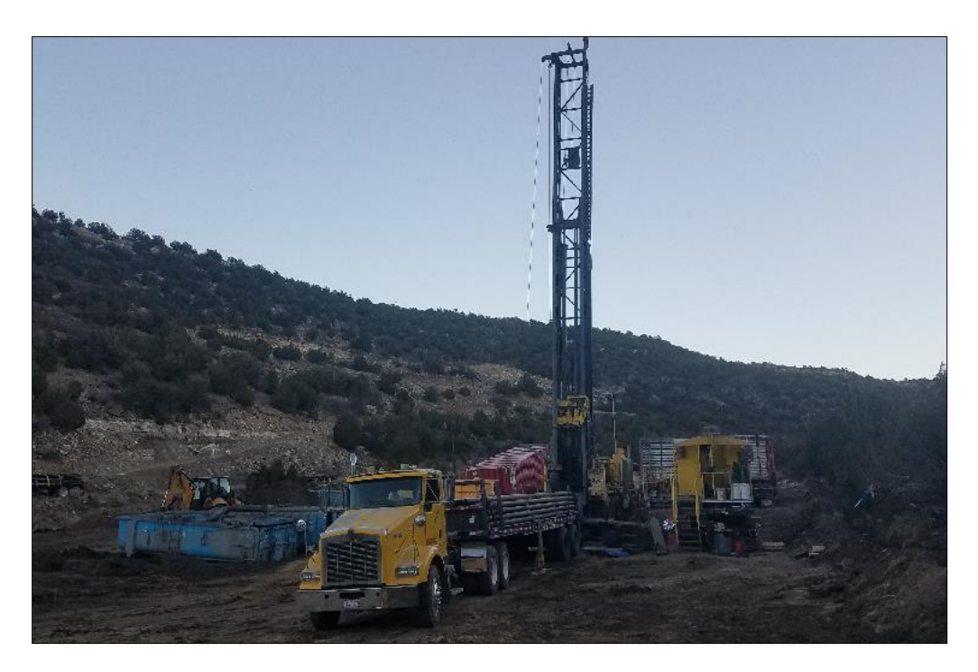
Figure 1 – Drilling Operations Underway on the Powell #23-25 Well

The Company looks forward to providing updates throughout the drilling program as well as updates on the testing of the Amerigo Vespucci #1 well.