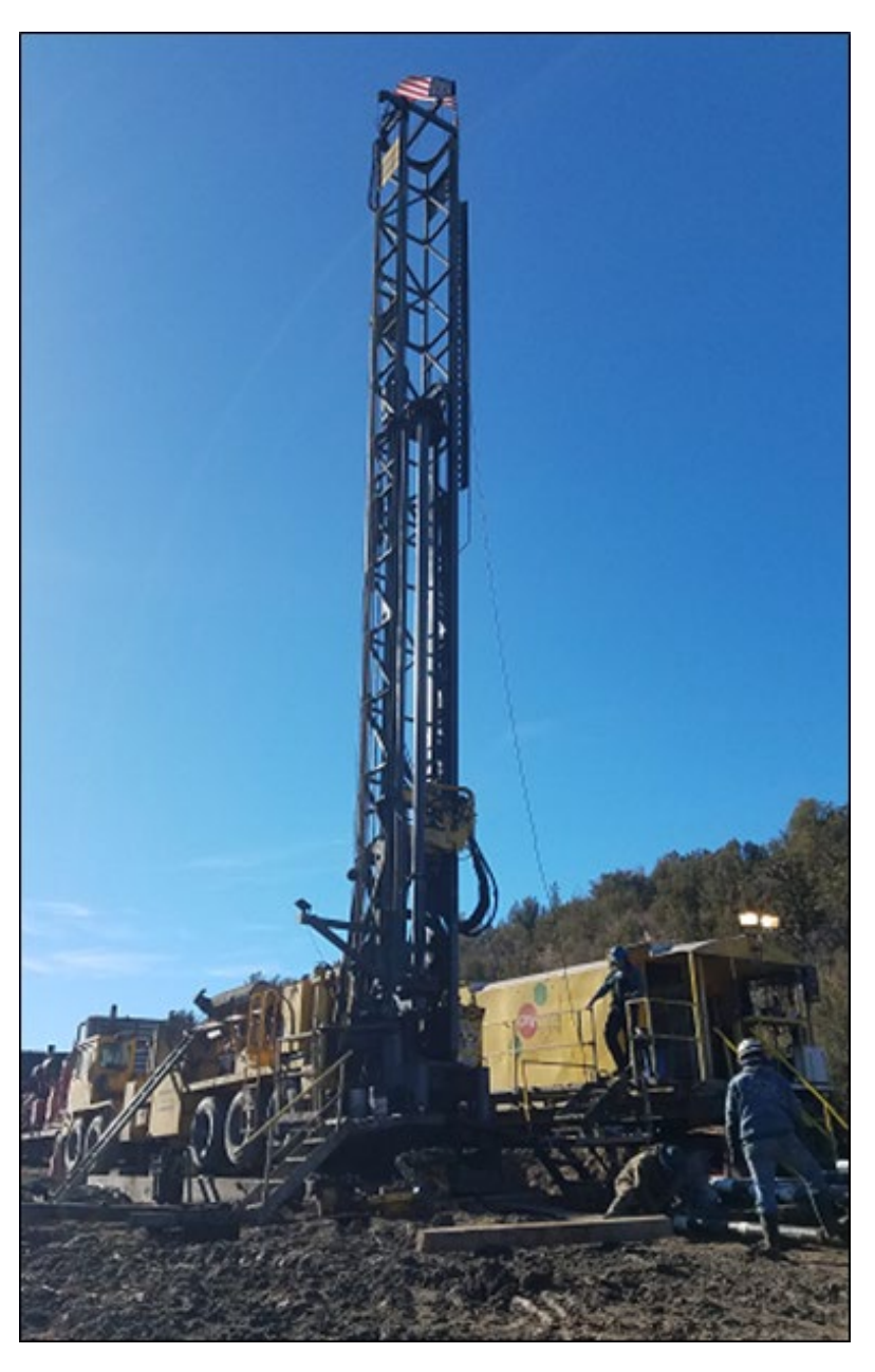
Drilling Operations on the Powell #23-25 Well